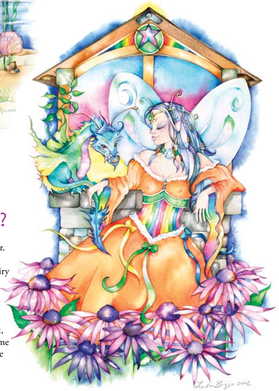
Alter of Enchantment

In the immediate future I need to make diner. In the long term—my ego would like to produce a collection of 11 or 7 inch vinyl Fairy Art Dolls representing my fantasy characters. However, my heart and my mind just want to paint. I have learned that the business of Art is all too consuming. So I try to paint and draw as much as I can. My hopes is that, when I die, I will have painted as much as time would allow. My life transposed as art will be a simple gift to anyone who enjoys it. If it brings a smile to anyone's face then I did my job while on this crazy planet.