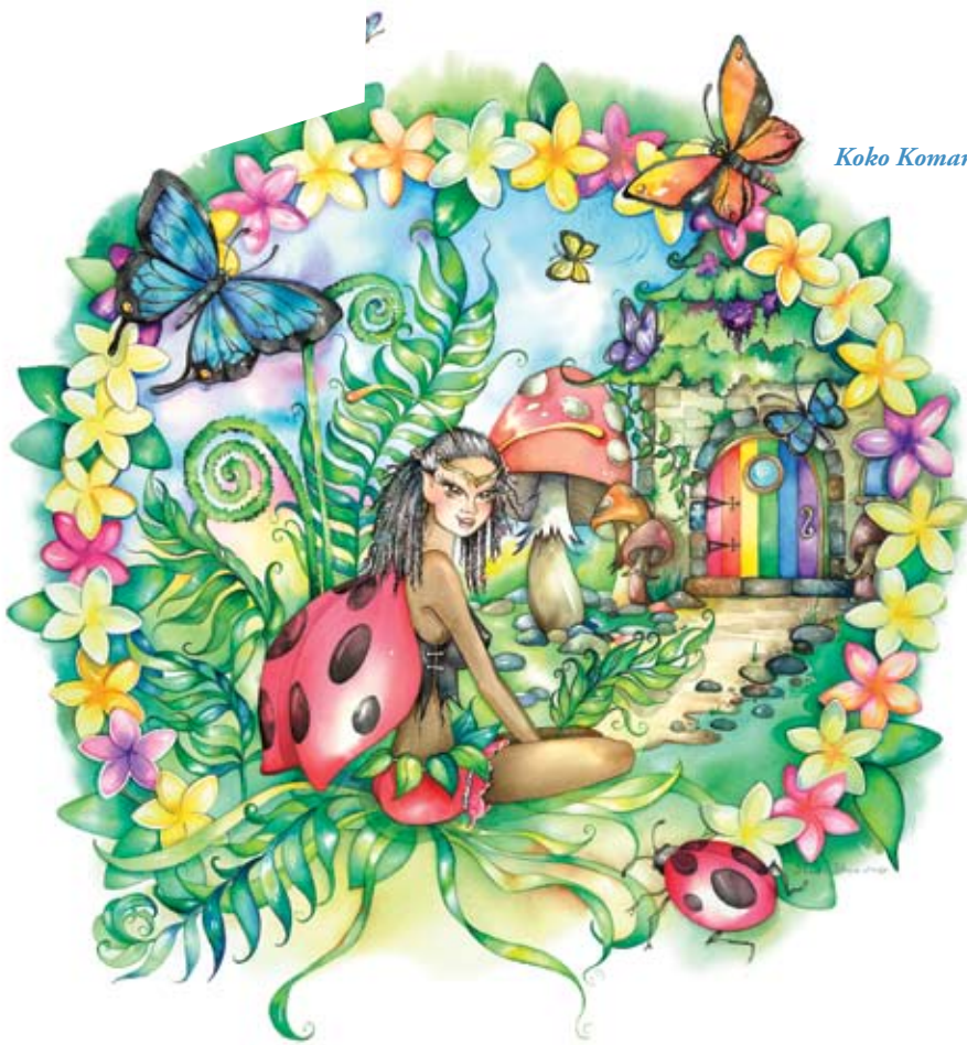
Koko Komani Spirit