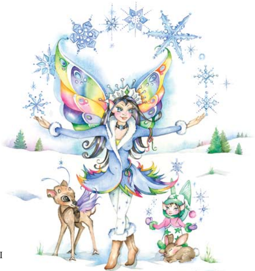
Snow Queen