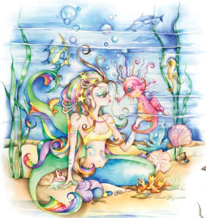
Bella's Paradise © Linda Biggs All Rights Reserved

Gosh, for me a painting is never finished – I simply run out of time. Once I sign it, in pencil, I try to leave it alone. My paintings are driven by manic moods and it's hard to go back and adjust something when my head is in a different place. I have gone back and done a little touch up here and there—but then I focus too much on what else I need to adjust so it's best for me to let it be.